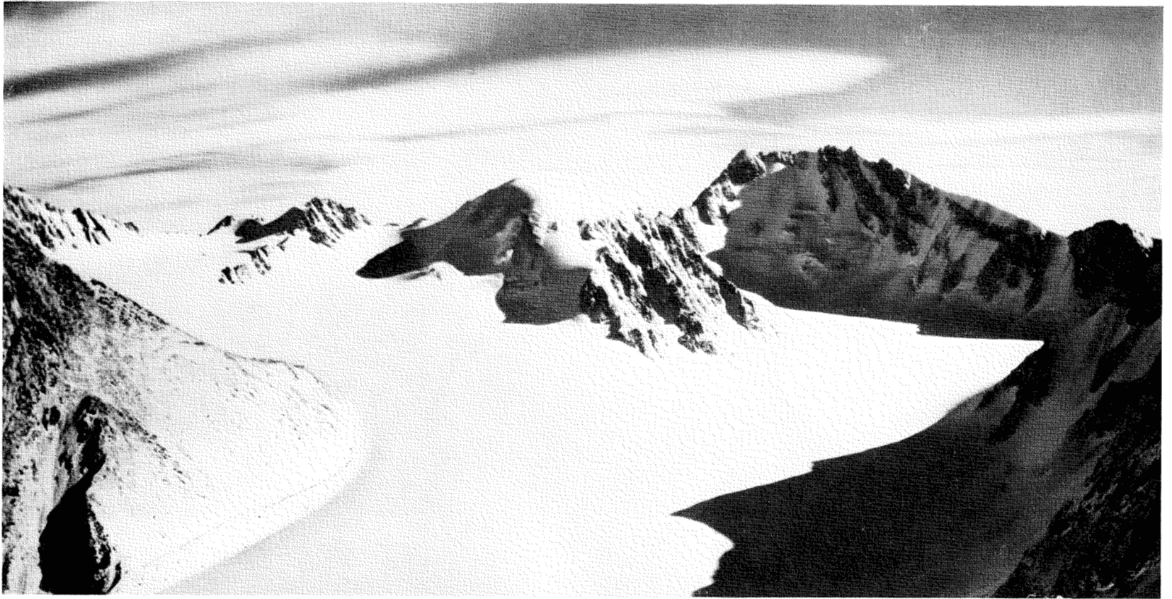
Fig. 2. View looking east to southeast into the three cirques at the head of McCall Glacier. The small dot in the right half of the uppermost (left) cirque is the main station. The peak beyond the lowest (right) cirque is Mount Hubley, 8,915 feet (2,717 m.).