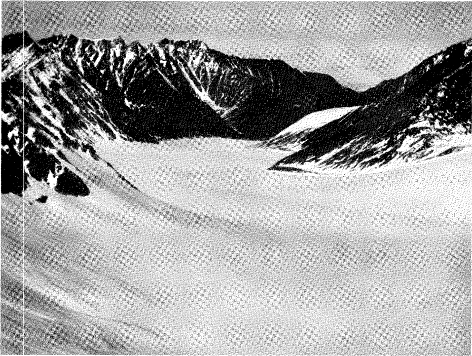
Fig. 3. View down glacier from west ridge of Mount Hubley. Note hanging glacier in right middleground, avalanche tracks in left foreground, and ski tracks in right foreground.

By June 13 both glacier camps were completed. Micrometeorological instruments were in place and working. The 100-watt radio linking the glacier with all other radio stations in north-central Alaska was operating. A 3-month supply of fuel and rations was cached at the camps and the scientific program was at last fully under way.