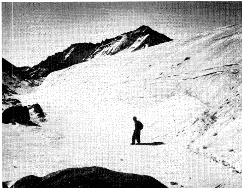
Fig. 6. East side of terminus of McCall Glacier, looking up glacier. The gully is filled by a stream in summer.

The stream following the right-hand side of the ice is a major surface feature from the area above the sharp bend to the vicinity of the slight bend below the lower camp where it becomes subsurface until reaching the terminus (see Fig. 6). There is no single drainage feature of this type along the left-hand margin except in the lowest fourth of the glacier and most of the melt water on this side seems to flow over the ice surface. There is a second well into which some surface runoff flows, which is located in mid-glacier a little below the lower camp.