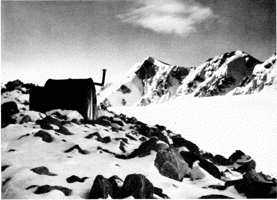
Fig. 5. View up glacier from lower camp. Corniced peak is Mount McCall.

0.3 to 2 m. long, which stand up as the high ground between meltwater channels. Most of the glacier, especially the lower half, is covered with a mantle of dust, rock, and boulders, many of which melt into the ice and give it a pock-marked surface. The size and depth of the cavities depend on the objects causing them, and they range from a few millimetres in diameter to basins the size of a bathtub around large boulders. On the lower fourth of the glacier there are several boulder trains the members of which blanket the ice and become pedestalled. As a result of this rough surface travel on the ice is quite easy, except on warm windy or rainy days when melting is rapid and the surface becomes slippery. An area in which the hummocks are much less pronounced lies opposite the lower camp. It is the location of the lower air strip during the months when the snow has melted off the glacier (see Fig. 5).