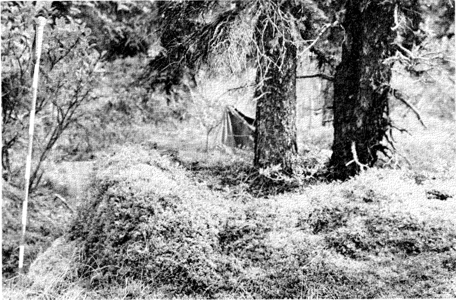
Fig. 1. Conspicuous mound surrounding two white spruce. Bands on pole are 1 dm. in width.

the mound. Where the moss mat remained undisturbed, the upper surfaces of the frozen lenses were within 30 cm. of the moss surface at the end of August. It is presumed that the lenses remain frozen the year round.