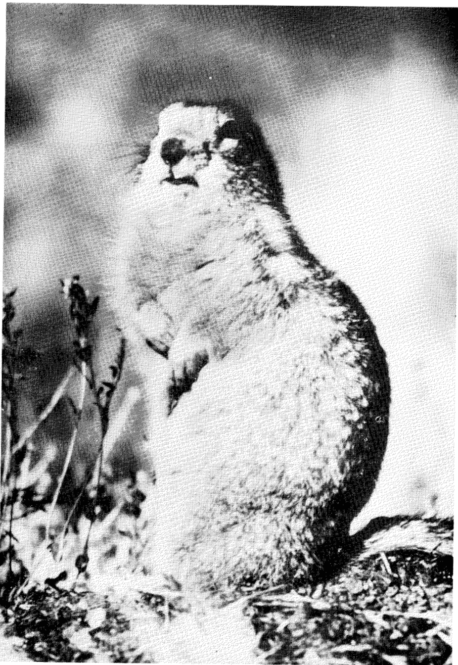
Arctic Ground Squirrel near Rankin Inlet.