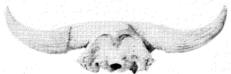
FIG. 2. Post-cranial view.