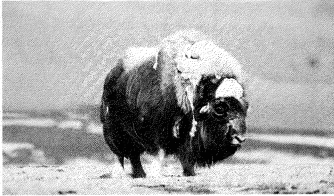
FIG. 1. Lone bulls, temporarily excluded from the herds by dominant bulls, are a common sight during the breeding season in August and September.