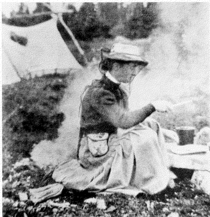
Mina Hubbard on her 1905 Labrador expedition.