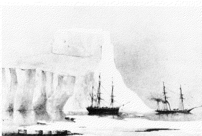
Resolute and Intrepid passing an iceberg in Baffin Bay, July 1852. Both illustrations are from McDougall's Voyage of H.M.S. "Resolute."

Although he hardly rates as an explorer, Sir Henry Kellett rendered a most valuable service to polar history by rescuing the Investigator and so preserving the record of her sensational and often perilous voyage.