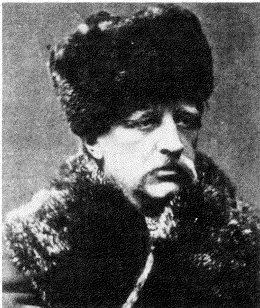
Nordenskiöld, 1880: the " Vega " photograph. Reprinted with permission from Kish, North-east Passage .

Three years later an attempt was made to reach the Pole, after a winter spent making meteorological and magnetic observations, as well as studies of stratigraphy, geology and animal life. Nordenskiöld himself spent the winter writing a history of Swedish science. Businessmen supported the voyage in the hopes of exploiting recently discovered phosphorous deposits. Ice prevented the expedition from reaching