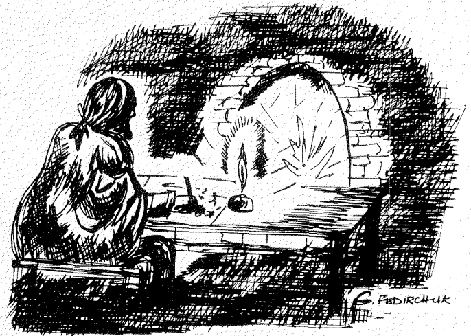
The author's impression of Peter Pond.

In the fall of 1778, Peter Pond built what became known as the Old Establishment on the Athabasca River approximately one-half mile downstream from the confluence with the Embarras River. By establishing himself in Athabasca Country and trading directly with the native inhabitants, he effectively curbed the flow of fine furs to the Hudson's Bay Company. Pond wintered at the post. His reward was great. The Chipewyans of the area brought him thousands of the finest, darkest, silkiest beaver skins he had ever seen. Perhaps even more significantly, they introduced him to the merits of pemmican, a mixture of dried buffalo meat and fat that was lightweight and stored well. To ease and facilitate fur trade exploration and travel, Pond set up a series of caches of pemmican along the Athabasca route, successfully negating the necessity of daily hunting and expediting rapid travel to and from the North. With his promotion of the use of pemmican, the advantages of using it for brigade provisioning became apparent, resulting in the "pemmican trade," which later characterized the fur trade. Without Pond's "discovery" of pemmican and the institution of pemmican caches, the life support system of the brigades and the character of westward exploration would have been entirely different.