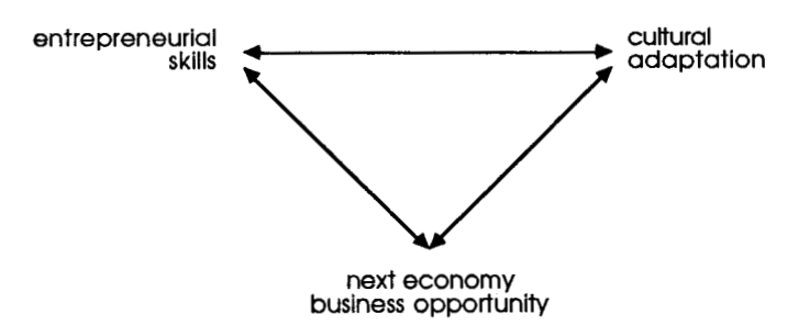
FIG. 5. Paddle Prairie Mall synergism.

As an entry point to a unified approach analysis of the case study, the authors note the emergence of a significant triad in the creation of the Paddle Prairie Mall corporation (Fig. 5).