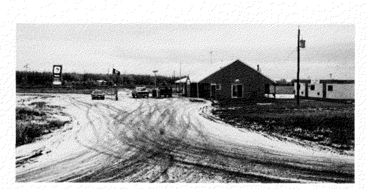
FIG. 3. The Paddle Prairie mall complex in northern Alberta.

cash in full for their purchases. Prices, where possible, were rounded off to even amounts to avoid having to produce awkward amounts of small change. A tight credit policy was extended on day one, in sharp contrast with the old government store, which served to reinforce a difference in operating policy. The entrepreneur did not wish to be viewed as part of the old northern store system, which extended liberal credit beyond the capacity of the local economy to repay and consequently forged a master-servant relationship between store and consumer.