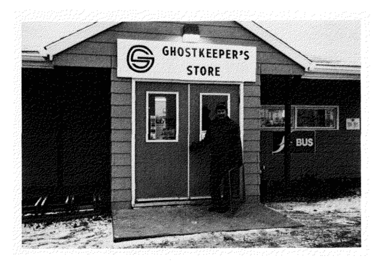
FIG. 1. The entrepreneur opening business for the day at 8:00 a.m.

In choosing to leave a career increasingly associated with Metis rights and their provincial and national expression, the entrepreneur has returned to his roots on the settlement. The decision to go home was taken to enable the creation of a small business, to provide security for a growing family (adopted twin boys and a new baby expected in 1988) and to care for aging parents. In returning to Paddle Prairie with his family, the entrepreneur has consciously avoided a small business start-up in what might prove to be a more lucrative (in terms of profits) urban setting (Fig. 1).