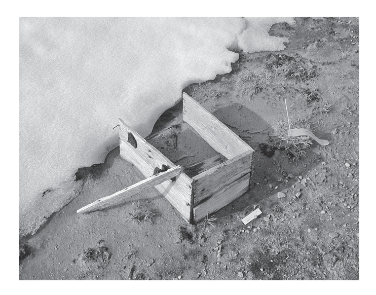
FIG. 3. Wooden box with leather hinges (SbJk-1:3).

food can) were not in the locations shown in the photograph taken in 1999 (Brooks et al., 2004:225), although there was no evidence that anyone had visited the site since that time. All surface finds were collected; however, because the duration of human activity at the site was thought to have been relatively brief and to have occurred at a time when the ground was frozen, only limited excavations were undertaken to free portions of several artifacts partially covered by a thin layer of windblown sand (e.g., pieces of fabric) and to recover a small number of geological samples that apparently had been pushed into the soft sand by the weight of overlying rock specimens. Apart from a few fragments of poorly preserved paper found on the underside of several of the buried rocks (showing that some or all of the rock samples had originally been wrapped in paper), the excavations revealed no evidence of subsurface cultural deposits.