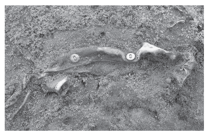
FIG. 4. Garment fragment, possibly underwear, with buttons (SbJk-1:6).

With the exception of the geological samples, which are undergoing analysis at the University of Waterloo, the artifact assemblage recovered from SbJk-1 in 2004 is currently at the Canadian Conservation Institute for assessment and treatment. The assemblage includes the items described by the site's original discoverers as well as other items that presumably were covered by snow when the site was visited in 1999. These include a partial wooden box, a small wooden box lid, and another box part, all apparently from different boxes. The small box lid, which measures approximately 10 cm square, has two recesses in its inner surface and appears to be from a box designed to hold some piece of specialized equipment. The partial larger wooden box (Fig. 3) may have held the geological samples. Also found was a small metal funnel, probably used with the fuel can to fill the stove. Five separate pieces of canvas were found, one with grommets and rope attached and tentatively identified as a duffle bag. At least one of the other pieces of canvas was of a much heavier gauge, indicating that more than one canvas item is represented. Numerous fragments of rope of different thick-