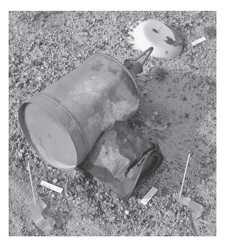
FIG. 5. The galvanized fuel container (SbJk-1:18), rusty food can containing geological specimens (SbJk-1:17), and partially buried enameled plate (SbJk-16) as found in 2004.