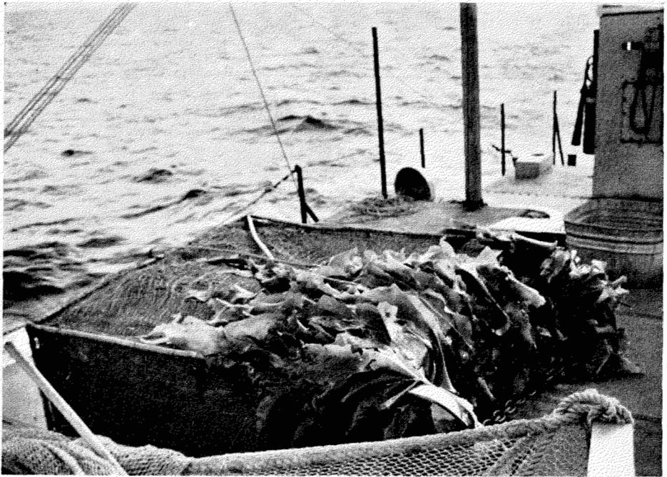
Fig. 2. Four-foot dredge with algae on deck of LMC William E. Ripley , August 10, 1954. The principal species about the mouth of the dredge is Phyllaria dermatodea .

Of the animals taken with the algae in this dredge-haul, only the caprellids and Spirorbis appear to be closely tied to the algal association although the taking of four species of cottids suggests the importance of the bed as a feeding