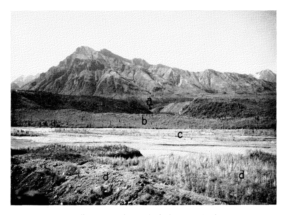
Fig. 4. Matanuska Valley opposite the mouth of Glacier Creek. The canyon of Glacier Creek (a) is partly blocked by moraine (b), one mile from the present terminus. The slightly terraced outwash plain (c) separates the moraine (b) from two younger moraines (d) that lie within a quarter of a mile of the present terminus of Matanuska Glacier and are probably less than 4,000 years old.

than a quarter of a mile west of the terminus (Fig. 4). The only remnant of the moraine representing the 1-mile advance is a ridge that partly blocks the mouth of the canyon of Glacier Creek. An equivalent moraine remnant forms a ridge north of the Matanuska River. At both localities the opentextured morainal deposits consist of slabby, angular fragments of schist, slate, and graywacke that are similar to the rocks of the central Chugach Mountains. Near Glacier Creek these deposits overlie silty till, which includes rounded boulders, and in a few places the moraine is covered with a mantle of as much as 12 inches of eolian silt or loess. The upper 4 to 5 inches of the loess is oxidized. The vegetation consists of second-growth brush and some mature spruce. This moraine is the oldest of the younger group of moraines that post-dates canyon cutting. The age of the oldest moraine may be a few thousand years, but less than 4,000; however, evidence for dating this moraine precisely is not available.