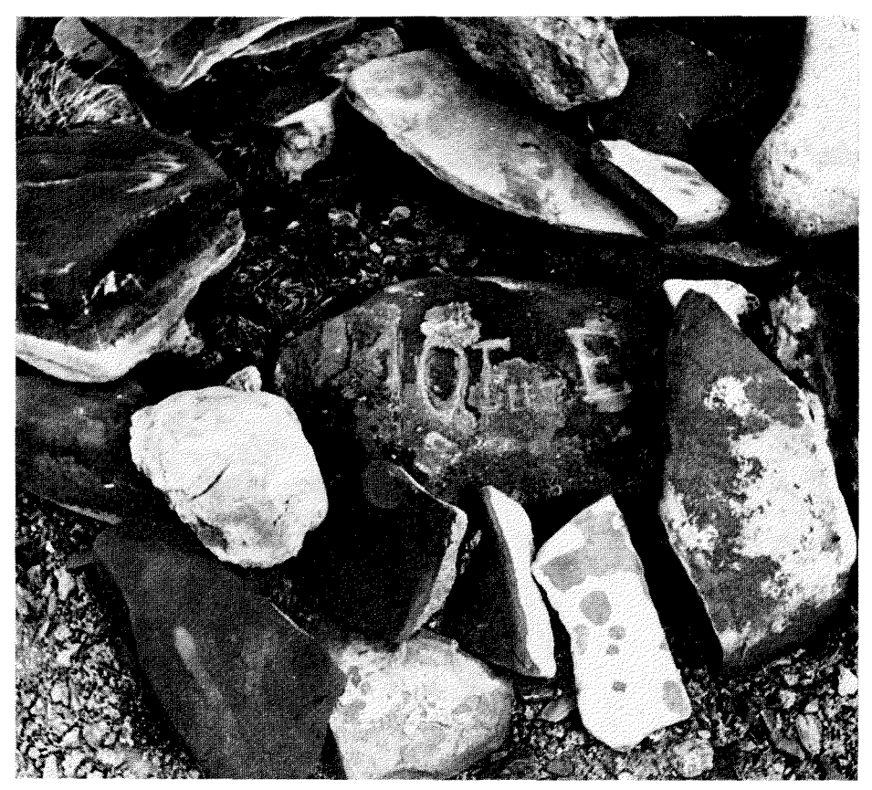
FIG. 2. Marker stone of Capt. C. F. Hall's "farthest north" cairn near Cape Brevoort. "10 FEET E," engraved in October 1871, indicates the position of the buried metal cylinder containing the 90-year-old copy of Hall's report. Note the lichen growth over figure "1". 23 June 1966.

most point in the world attained on land at that time. The engraved stone (Fig. 2) and wooden board indicating the position of the buried metal cylinder containing the report are still in position. The cairn report proved to be Capt. Hall's last, since he died on returning to the winter quarters of the U.S.S. Polaris at Thank God Harbour (Davis 1876).