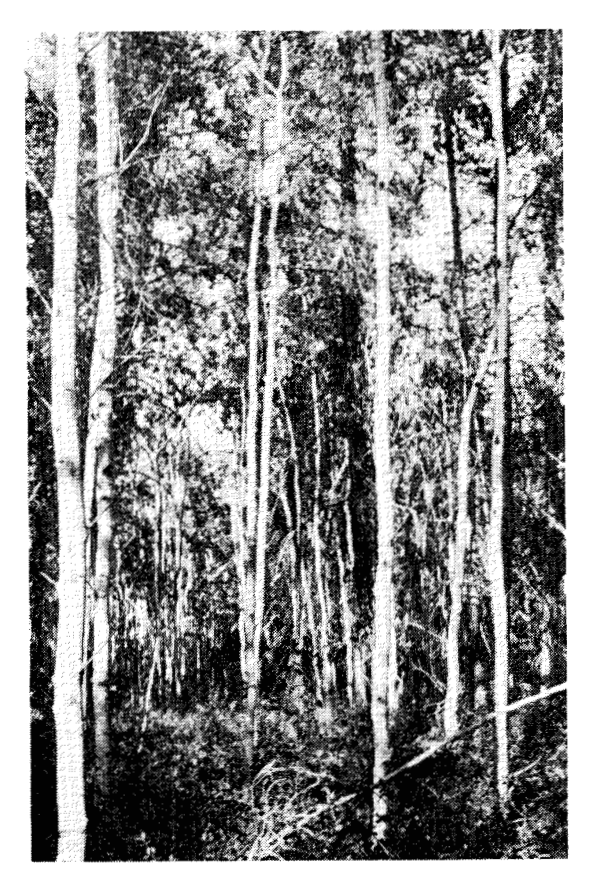
FIG. 3. Aspen stand on plot 1 that integrates with jackpine stand.