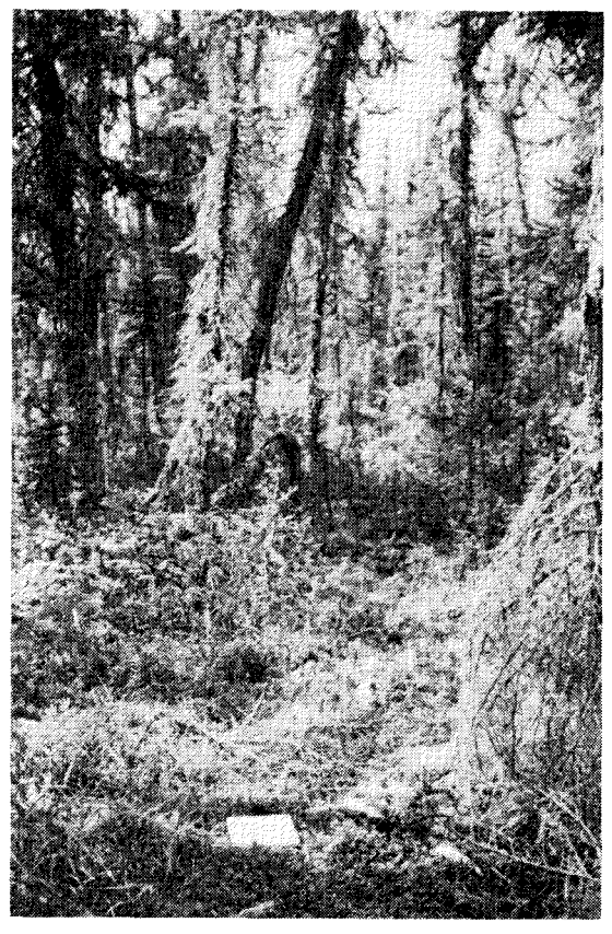
FIG. 4. Black spruce trees forming the dominant tree cover in a feather moss-black spruce association (Plot 4).