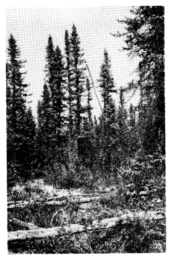
FIG. 5. Open canopied subarctic forest characteristic of the Hudsonian life zone.

feet apart. Thus each plot was divided into 28 smaller sections around the edge of the plot and 36 larger squares within the plot. The intersections of this grid system were marked with red surveyor's tape and the nearest trees numbered.