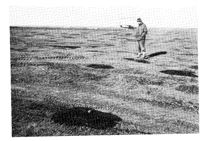
FIG. 1. Wet spots occurring on scraped surface in work area of Suncco Camp no. 3002 on N. E. King Christian Island. This area was initially cleared during the spring of 1971. Photograph taken on 17 July 1972.

Excavations were made on both the disturbed surface, where the damp spots occurred, as well as in the undisturbed area adjacent to the camp. One relatively large wet circular area 1.0 - 1.5 m. in diameter was excavated in the work area (Fig. 2). The upper 10 cm. were slightly drier and more dense and cohe-