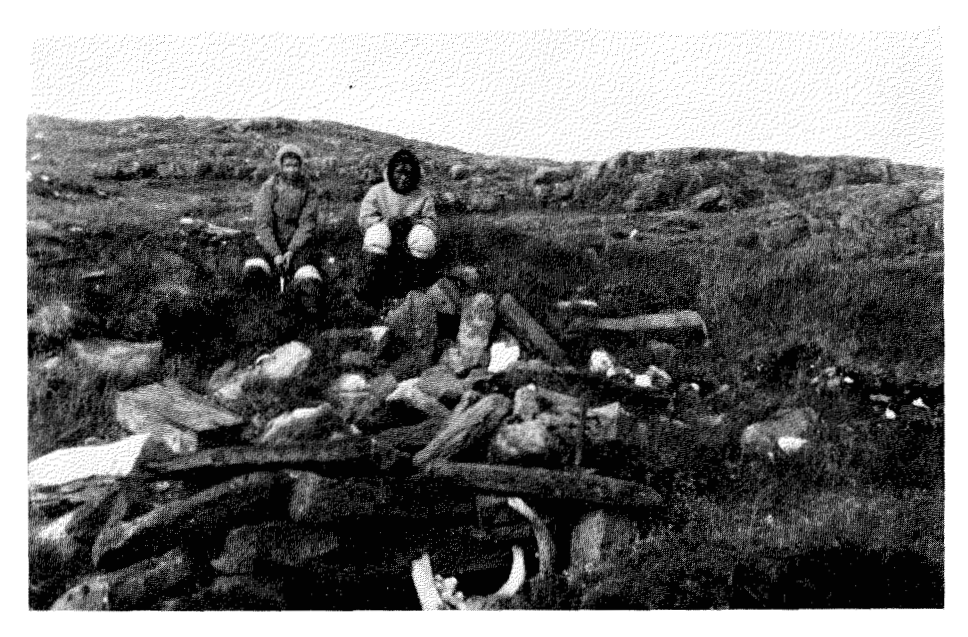
One of the younger Nuwata houses before excavation, August 1938. The porch roof is still intact.