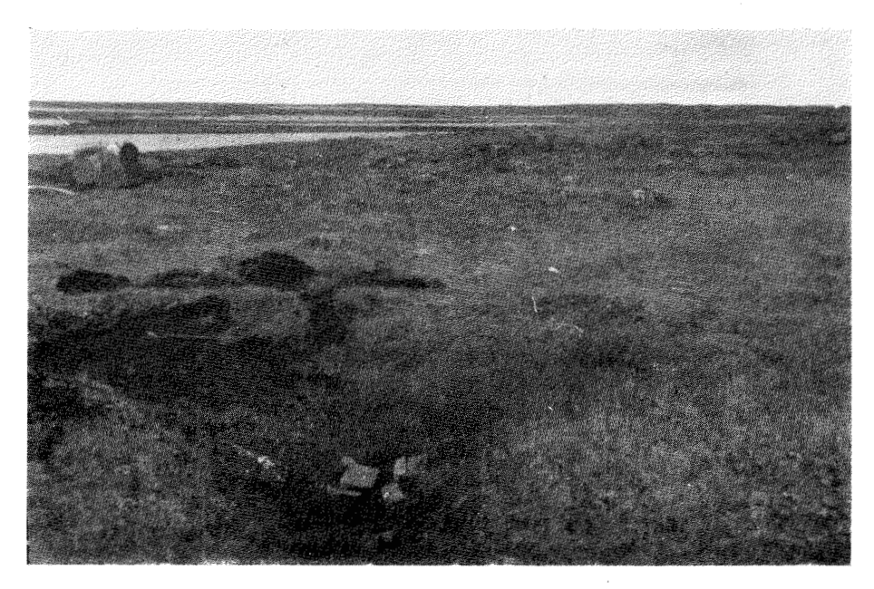
One of the oldest Nuwata houses during excavation, August 1938.

group, of two houses only, was about 15 feet higher. We dug twelve of the twenty-two houses, which apparently varied greatly in age. When we were there the porch roofs were still intact on the youngest houses, which did not appear to be much over one hundred years old. Several of the Nuwata houses, as well as those at Storm Cove, had been disturbed recently by the local Eskimo digging for curios to sell at the trading posts. In addition, they had removed most of the long whalebone roof supports for sledge shoeing and other purposes. The Storm Cove ruins were about a quarter of a mile inland and 50 feet above sea level. There were five houses, all somewhat older than the youngest houses at Nuwata. Of these five, three were excavated.