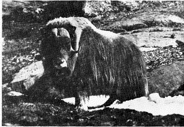
FIG. 2. Bull muskox rising from its cool resting place in a patch of snow in the Nyhavn hills, Mestersvig, on 3 July 1974.

Summer forage in this part of Greenland is largely restricted to land below the 200-m contour. Population estimates for each site have to make some allowance for areas that could not be visited, but which must have contained muskoxen. In the case of the three northernmost sites, this allowance is quite small (Table 2),