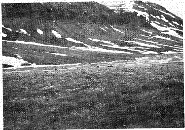
FIG. 3. General view of Horsedal on 6 July 1974. Such valleys are fairly typical of this part of Greenland. A small party of four muskoxen can be seen in the centre of the photograph.

Muskox densities were about three times as high in northern Jameson Land as they were in northern Scoresby Land, and this reflects the larger area of suitable feeding grounds available. Particularly favoured during July were early drying stream beds and meadows of moss and sedge. In the former situation, animals could clearly be seen to take fresh growths of Salix arctica . In drier areas, Betula nana , Cassiope tetragona and Vaccinium uliginosum were present in abundance, but muskoxen were not often seen feeding on these plants. Reindeer show a similar