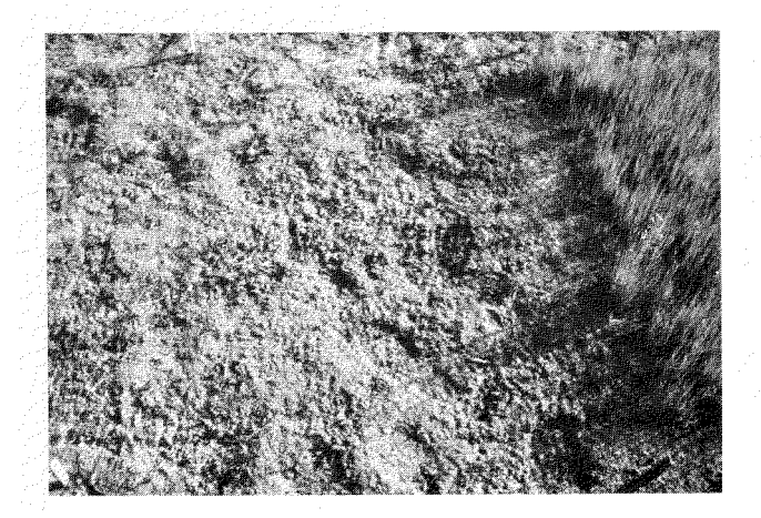
FIG. 5. Close-up view of oil-damaged wet tundra 1 September 1977, which had been seeded to alkaligrass. The vigorous growth of alkaligrass on right edge of photo was response to phosphorus fertilization, and the seeding failed without phosphorus fertilization.

The dry-matter production of seeded alkaligrass during the second and third growing seasons following germination were compared (Table 3). The data support what appeared in the field to be substantial improvement in vigor and growth following initial establishment. In 1977, production on the seeded plots receiving P-fertilization (Table 3) approached that of unfertilized tundra plants which had survived the spill (Table 2). During the observation period