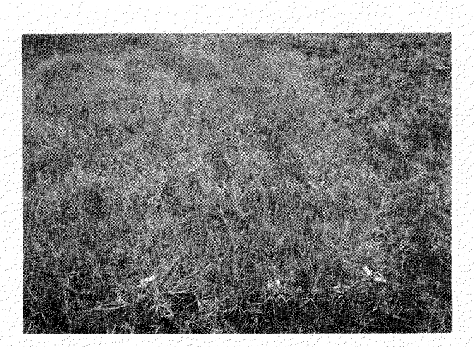
FIG. 2. Fertilized plot (8 September 1976) of arctic tundra five growing seasons after burning a late-winter oil spill. Notice the effects of phosphorus fertilizer on plant vigor and cover.