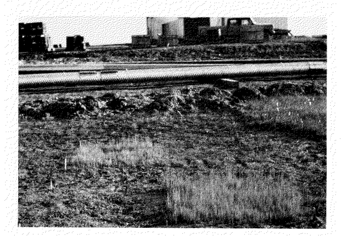
FIG. 4. A portion of the spill area on 1 September 1977 which was seeded to alkaligrass in September 1974. Seedlings established only in plots fertilized with phosphorus.

This seeding experiment possibly represents the first successful establishment of grass seedlings on an arctic tundra site from which all macroflora had been annihilated by oil. The autumn-seeded alkaligrass germinated during the 1975 growing season. Spring rye failed to germinate. However, the most noticeable effect was in the growth and establishment of alkaligrass (Fig. 4), mosses and liverworts in the P-treated plots (Table 3). Without P, alkaligrass seedlings failed to establish and no moss and liverwort bloom developed (Fig. 5). The critical need for P by grass seedlings in the Prudhoe Bay area has been well established in other of our experiments