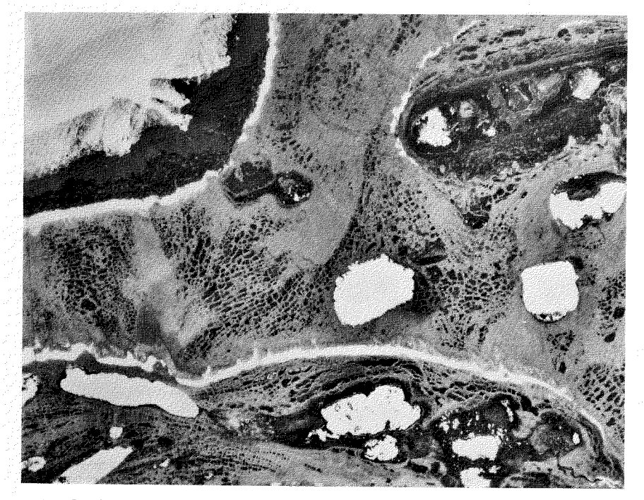
FIG.3. Portion of air photograph (BAR-147-069) of the Atkasook area showing abandoned cut banks of the Meade River (outlined by snow drifts). Active deflation pits can be seen along the crest. Stabilized sand areas cover portions of the cellular microrelief in left center of the photo. Strangmoor and orthogonal polygons occur in and adjacent to partially drained lake basins, upper right and bottom center.

The lowland areas in the basins of former lakes or former river terraces are characterized by a cellular pattern. In areas of younger terrain (2,000 to 4,000 years) associated with elevated terraces, meander cutoffs and some drained lakes, the surface pattern consists of regular, aligned cells or polygons that are 10 \pm m diameter (Fig. 3). The alignment is clearly controlled by boundary