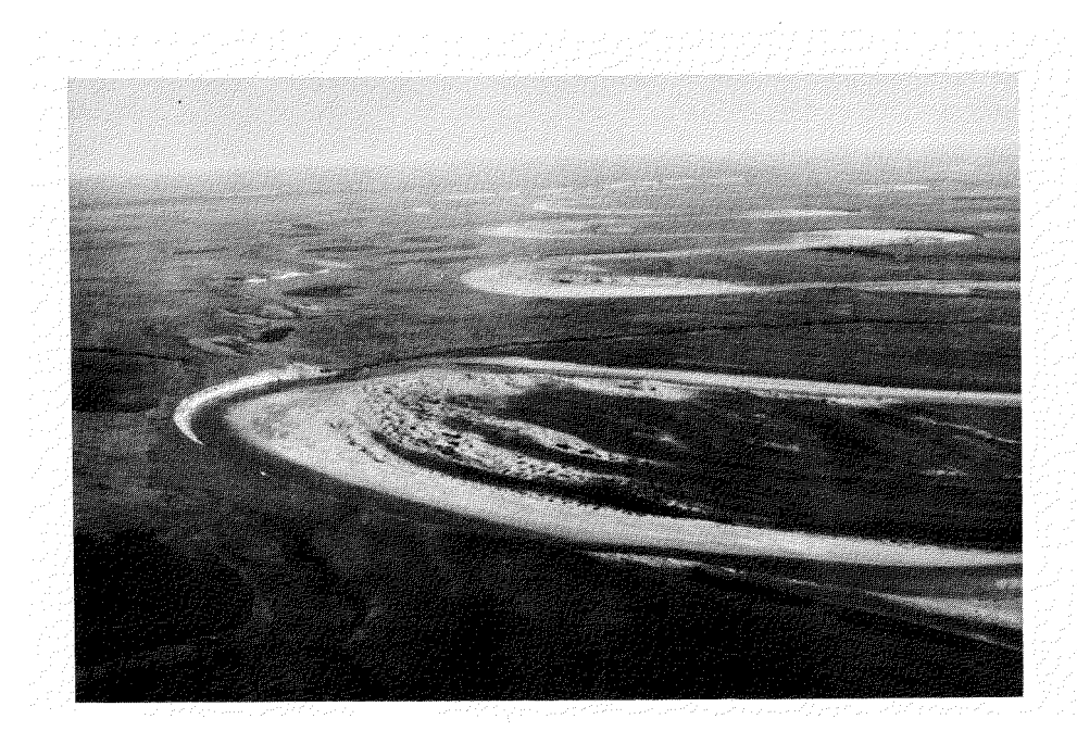
FIG.2. Meander loops characteristic of the Meade River and other rivers that traverse the sand region of the coastal plain. Active dune areas lie adjacent to point bars. Note low level terrace and abandoned and erosionally smoothed cutbanks in center and right center respectively.

1964), and now flows on the underlying, jointed Jurassic and Cretaceous sandstones and siltstones.