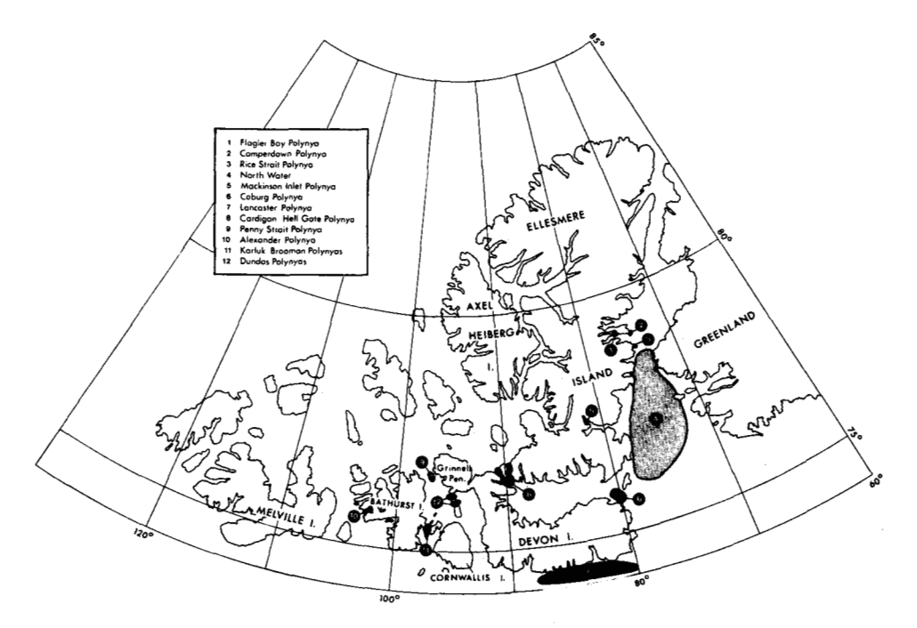
FIG. 1. Polynya locations in the Canadian High Arctic.

same position every year it is called a recurring polynya." This paper deals principally with the recurring polynyas although a few statements are made regarding what I have termed secondary polynyas for lack of better terminology. By secondary polynya is meant an area which appears to become ice-free several weeks earlier than the occurrence of regular regional breakup. Obviously the distinction between these two types of polynya may in some instances be difficult to define, but as a rule the primary recurring polynya is established one or two months prior to general breakup of the fast ice whereas the secondary polynyas appear only a few weeks before this event.