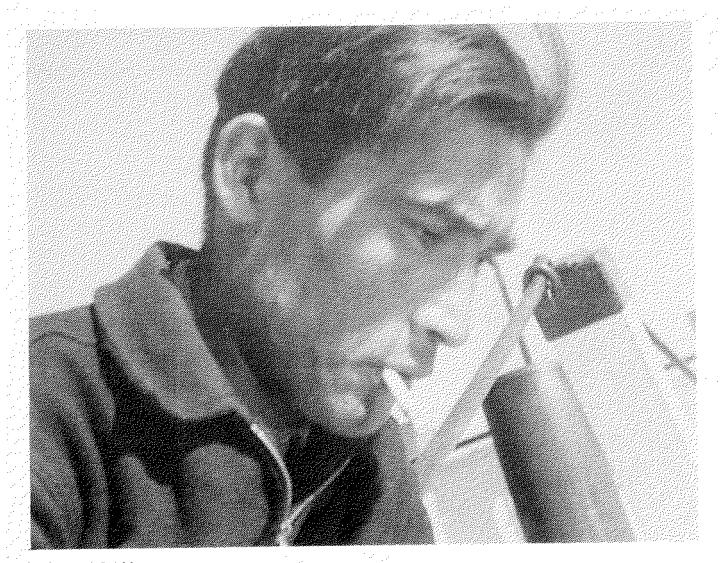
FIG. 22. Mâlo.