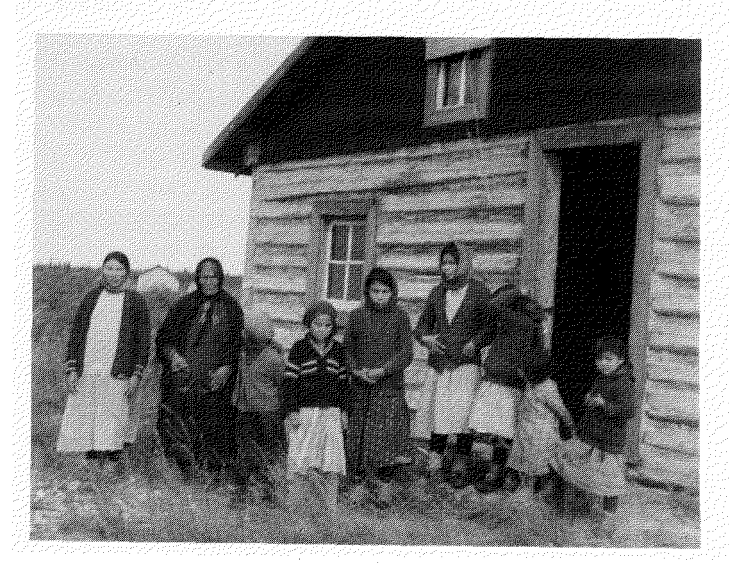
FIG. 23. "Sastudené at their encampment near old Fort Franklin."