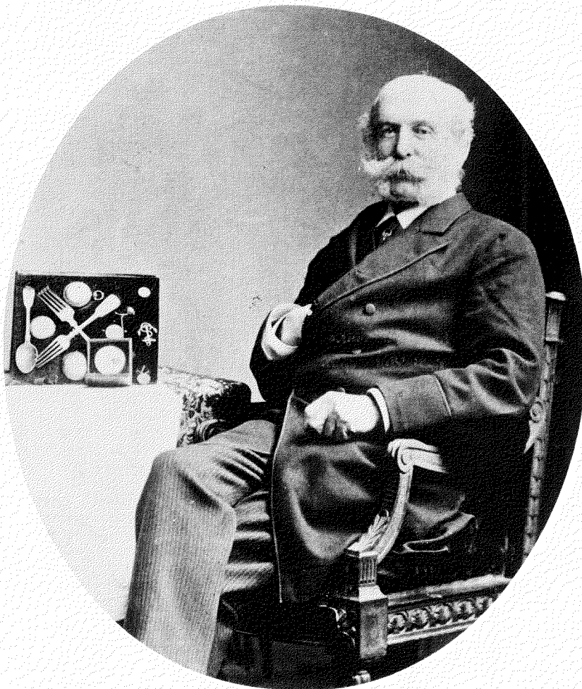
Dr. John Rae posed with some of the Franklin relics.

Dr. John Rae, who spent 22 years in British North America, accurately mapped more miles of North America's unknown northern coastline — excluding Hudson Bay — than did any other explorer. A frugal Orkney Islander, his explorations were the most thrifty ever undertaken. Unusually adaptable and a crack shot, he learned native methods of living off the land. Remarkably fit, he set records that have never been surpassed for speed and endurance on snowshoes.