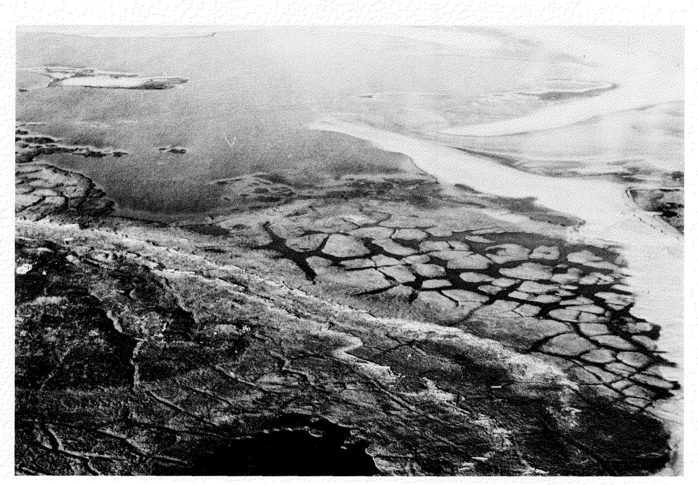
FIG. 1. Oblique aerial photograph of typical pattern of log debris in the study area (Tuktoyaktuk Harbour, September 1986).

Forbes (1981) provides a discussion of storm log lines in the Babbage River estuary on the Yukon coast, 150 km to the west of the study area. Using sequential aerial photography, he noted that logs identified on 1944 photos (collected a few days prior to the 1944 surge) showed little evidence of movement in 1952 photos but had significantly changed in distribution prior to 1970 (photos collected a few days prior to the 1970 surge). Either the 1944 surge was relatively low in the Babbage River area or a major surge occurred there between 1952 and 1970. Since such a large surge is unlikely to have gone unnoticed at Tuktoyaktuk during this period, these observations demonstrate how surge elevations vary with locality. A survey by Forbes and Frobel (1985) along the Canadian Beaufort Sea coast documented log debris elevations in excess of 2 m above MSL, although many of the survey sites were in exposed locations subject to storm wave run-up.