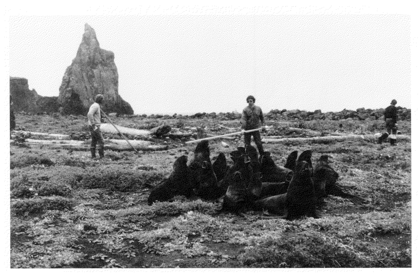
FIG. 2. Photograph showing a group of juvenile and adult northern fur seals on Bogoslof Island during 1983. The animals were sexed, counted, and released. Castle Rock is visible in the background.