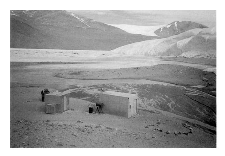
Lake Hoare and the Canada Glacier, Taylor Valley. Such lakes are permanently ice covered, whereas Arctic lakes become ice-free most summers. Canadians have worked from this U.S. station for many years.

in Antarctica. The cold-weather expertise of our engineers and technologists is in great demand among Antarctic Treaty countries.