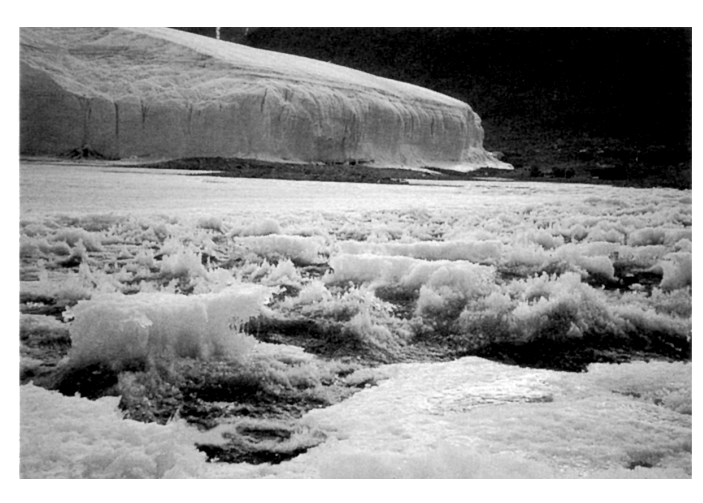
The ice cover of Lake Hoare with Canada Glacier. The surface is brittle and honeycombed because of radiation melting.

I am very much in favour of cooperative international science. Indeed, one of the great strengths of Canadian science is our ability to work productively with other nations or in international science organizations. But,