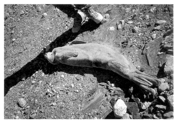
Life in the dry valleys! The absence of life on land is in striking contrast to the Arctic. For some reason, seals (like this one) become disoriented and flop inland until they die.

Canada also participates in the Committee of Managers of National Antarctic Programs (COMNAP), which deals with logistical and operational aspects of work in Antarctica. We are represented by the Director of the Polar Continental Shelf Project (PCSP), which is the logistical support system for research in the Canadian High Arctic. The Canadian Polar Commission pays Canada's dues to COMNAP. The Director of PCSP is also the current chair of the recently established Forum for Arctic Research Operators, which seeks to coordinate logistics for Arctic Research Programs.