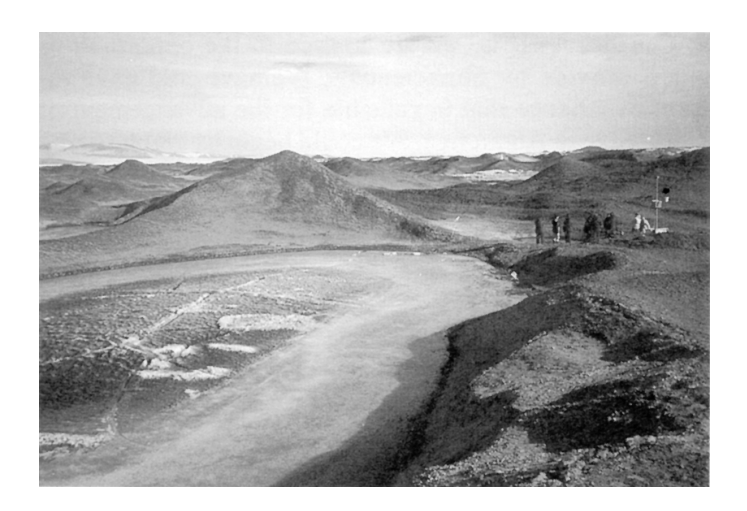
Summer melt pond in the debris-covered McMurdo Ice Shelf, site of experiments related to the increase in ultraviolet radiation in Antarctica. One of the researchers here was from Université Laval.

Much of the research in Antarctica and the state of its environment are of interest to all nations. The thinning of the ozone layer (and the associated increase in ultraviolet