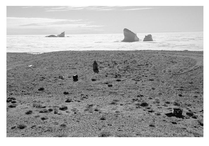
The transit and other artifacts, as found in 1999 on the beach, Axel Heiberg Island, Nunavut.

Objects found on the site included a wooden box containing a small transit (with spare parts and tools), an unopened tin of food, an enameled metal cup and plate, a small compass, a heavy canister with cork stopper probably intended to hold fuel or spirits (about two gallons in capacity and galvanized, or at least unrusted), and a small pile of rock samples. Only the compass and the transit were collected for preservation and identification. Protruding through the surface sand was evidence of additional material, including what appeared to be tent canvas, as well as printed material and a shirt (or long underwear) with label of German origin. Most of the artifacts were still on the surface, though some items were partially buried in winddrifted sand. The compass, for example, was about 95% buried, lying face up in the centre of the site. The transit box, found near the west side of the site, was only slightly settled into the sand. The item of clothing was inconspicuous at first, being largely drifted over. It had wooden buttons, and the label was still attached to the collar. This subsurface material was left undisturbed, to await the proper archaeological survey of this site that the Nunavut government is planning for this summer.