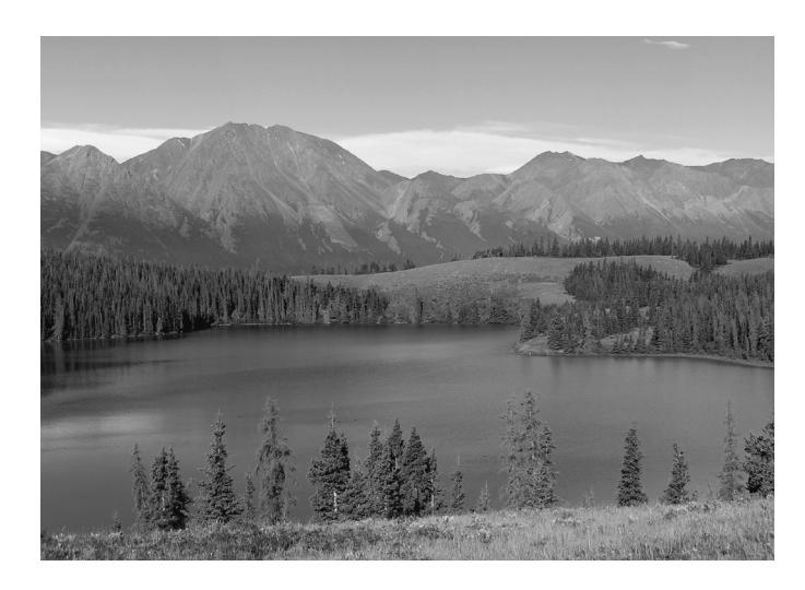
FIG. 1. Grassland site (hillside opposite lake) for functional group removal experiment.

Nutrient supply rates were measured using ion exchange membranes (Plant Root Simulator (PRS<sup>TM</sup> probes; Western Ag Innovations Inc., Saskatoon, SK). The PRS probes were placed in the soil each growing season to measure in situ nutrient supply rates. Ions measured include NO<sub>3</sub>, NH<sub>4</sub>, P, K, S, Ca, Mg, Mn, Fe, Cu, Zn, B, Al, and Pb. In addition, soil moisture (using a water content sensor; Hydrosense Water content measurement system, Campbell Scientific, Australia) and percent light transmittance (using a quantum meter; Apogee Instruments Inc.,