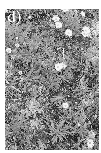
FIG. 2. Functional groups used in removal treatments: a) legumes, b) graminoids (grasses and sedges) c) non-leguminous forbs, and d) no-removal (control).

nutrients the role of a functional group is partially determined by the environment in which it is found.