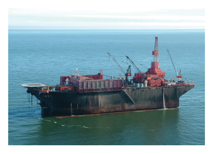
FIG. 3. The Steel Drilling Caisson (SDC) on location at Devon's Paktoa C-60 exploration well.

completed in late March 2006. The equipment and personnel involved allowed the project to meet both the operational and the geological objectives on budget. In addition, operations were conducted in a manner that was safe, environmentally responsible, and respectful of Inuvialuit concerns. Devon Canada Corporation is currently preparing an application for approval of a Significant Discovery Licence for hydrocarbons encountered as a result of the drilling program.