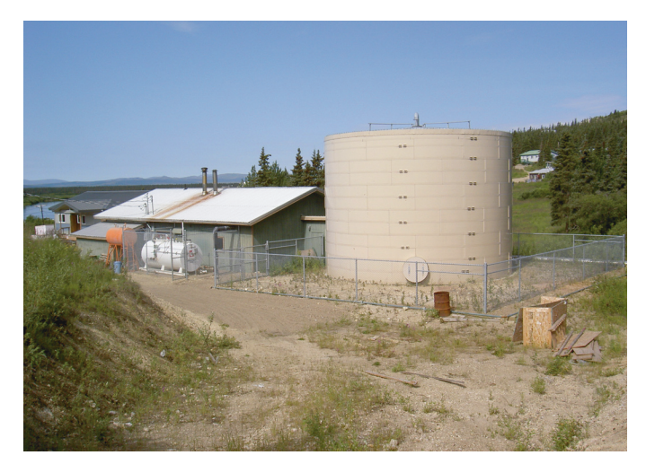
FIG. 3. Water tank in White Mountain, Alaska.

In White Mountain, a well was drilled as early as 1964, followed by another well in 1968. By 1986, a piped water delivery system was installed, and upgrades have occurred continuously since then. The well currently in use was drilled in 1968 and is 129 feet deep. Information provided by community members in 2004 indicates that the original well, drilled in 1964 to a depth of 118 feet, was contaminated with oil. The newer well, 400 feet up a hill from the original 1964 well location, is pumped continuously at 24 gallons per minute to meet demand and keep a 150000-gallon storage tank full. Major upgrades were made around 1981, including a new water plant and tank, with pipes following within a few years (Fig. 3). When the 1981 water plant was installed, the design population was 250 people, with a per capita use of 15 gallons per day. The distribution system has one loop serving the town, and continuous pumping prevents freezing. The water system and washeteria are operated by the municipal government. Water is filtered, chlorinated, and fluoridated (ADCCED, 2004a; authors' field notes). Piped