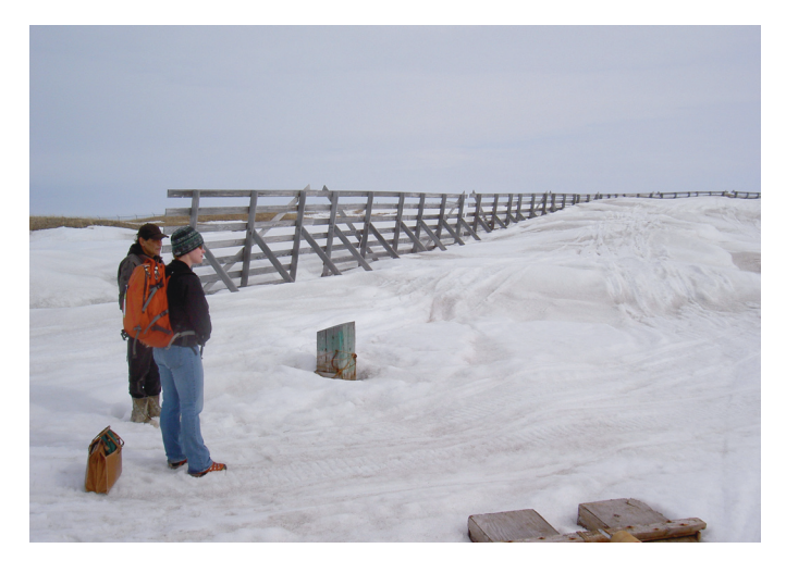
FIG. 2. The lined water catchment of Shishmaref, Alaska, surrounded by a fence. An engineering graduate student and a Shishmaref resident are surveying the outer area of the community's potential water supply.

Shishmaref's central water system is operated by the municipal government. The water system consists of raw water collection, water treatment, a washeteria, a central watering point, and water delivery by vehicle. The washeteria, an important central location in many villages, is the building that houses the water treatment plant, as well as public showers, toilets, and washing machines. Raw water to supply the system comes from a surface water source and is filtered and chlorinated (ADCCED, 2004b). Shishmaref's surface source is a lined catchment area, on one side of which snow fences were built to enhance snow catch (Fig. 2). Snowmelt is then retained at the surface for use. Treated water is stored in a 300000 gallon tank. A project in progress is installing household plumbing and a flush/ haul system. Those households with tanks installed can have water delivered, and others can haul water from the watering point at the washeteria. Waste is deposited in sewage lagoons via sewer pipes (several public buildings), honey bucket haul, or flush tank haul.