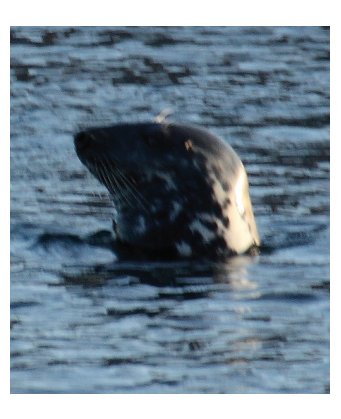
FIG. 2. A grey seal observed in southern Greenland at 59^{\circ}53' N, 43^{\circ}28' W on 30 August 2009.

Although the observations described above might be valid, authors who were Brown's contemporaries do not mention grey seals when describing the Greenlandic fauna. H.J. Rink was a scientist and inspector of the colonies in southwest Greenland and lived in Greenland from 1853 to 1868. In his book about the people living in Greenland (Rink, 1877), he thoroughly described species hunted by the Inuit, but he never mentioned grey seals. Winge (1902) reviewed all the available literature about mammals in Greenland up until the start of the 20th century, including information from Brown (1868), but he did not include the grey seal as part of Greenland's fauna. Apparently Brown had not convinced Winge of the existence of grey seals in Greenland, and none of the successive authors that have described Greenland's fauna have included the grey seal.