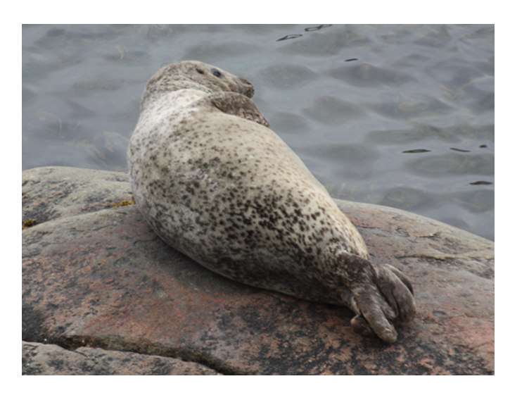
FIG. 3. Picture of what is possibly a young grey seal, taken at the same position as in Figure 2 on the following day, 31 August 2009.

The settlement closest to the harbour seal colony is Aapilattoq, located approximately 50 km to the west. During community meetings in November 2009, hunters from this settlement were asked if they had ever seen grey seals before. Two hunters claimed that they had seen these seals before, but that they are very rare. One elder remembered