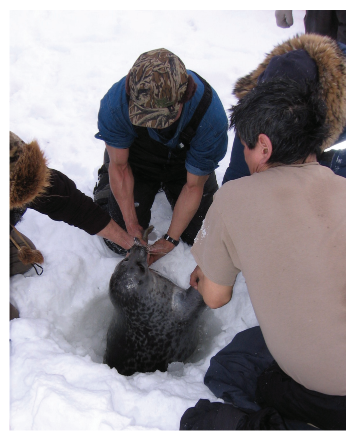
FIG. 3. Community technicians from Tuktoyaktuk, Northwest Territories, pulling a live-captured ringed seal from a net set in a breathing hole. This seal was instrumented with a satellite-linked transmitter and released at the same location, and its movements were tracked for three months.

Working together, the scientist and the harvesters can discuss and determine the expected sample size and sample composition (by sex or age class, for example) for a range of appropriate parameters (e.g., fish length, weight, fishing effort). Measurement of biotic and abiotic factors that are meaningful can be included as "value added"; however, care must be taken that the time, equipment, and resources needed to collect the 'extra' samples or measurements do not overshadow collection of the primary samples, tissues, or information. For example, it is sometimes possible to collect water level data using a simple staff gauge and record water levels daily along with water temperature, without compromising the basic data collection tasks (e.g., Sandstrom and Harwood, 2002).