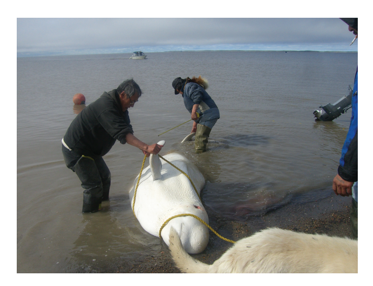
FIG. 2. Community monitor preparing to measure the fluke width of a beluga whale landed in the subsistence harvest near Tuktoyaktuk, Northwest Territories, Canada.