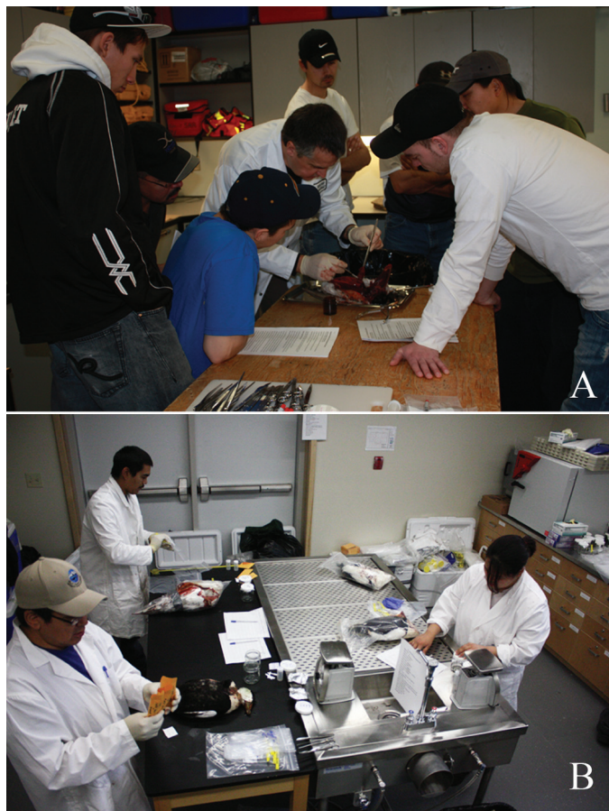
FIG. 3. A) Workshop space at Nunavut Arctic College used from 2007 to 2009. B) New laboratory facilities built with federal funding in 2010.