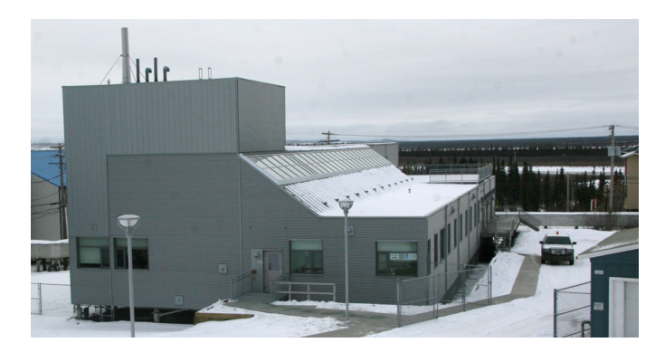
FIG. 2. The Western Arctic Research Centre (WARC), which replaced the original facility in 2011. WARC was built using funding received from the Government of Canada's Arctic Research Infrastructure Fund.

In 1984, the Legislative Assembly of the Northwest Territories established the Scientific Institute of the Northwest Territories (SINT). At that time, the Inuvik, Igloolik, and Iqaluit labs were transferred from the federal government to the territorial government of the Northwest Territories while the headquarters for SINT was established in Yellow-knife. Each of the three satellite stations supported regional field research, while the headquarters developed policy and advised territorial government departments on matters related to science, technology, and research.