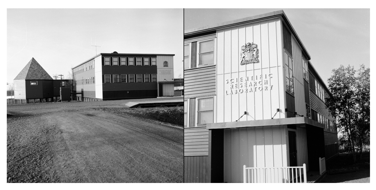
FIG. 1. The Scientific Research Laboratory shortly after its opening in 1964. The building with the cone-like roof to the left of the main facility houses the cosmic ray detectors owned by the Bartol Institute (University of Delaware).

located on Nanuk Place, a residential street just a few blocks away from the main facility. The Nanuk row houses remain in use, and in high demand, to this day.